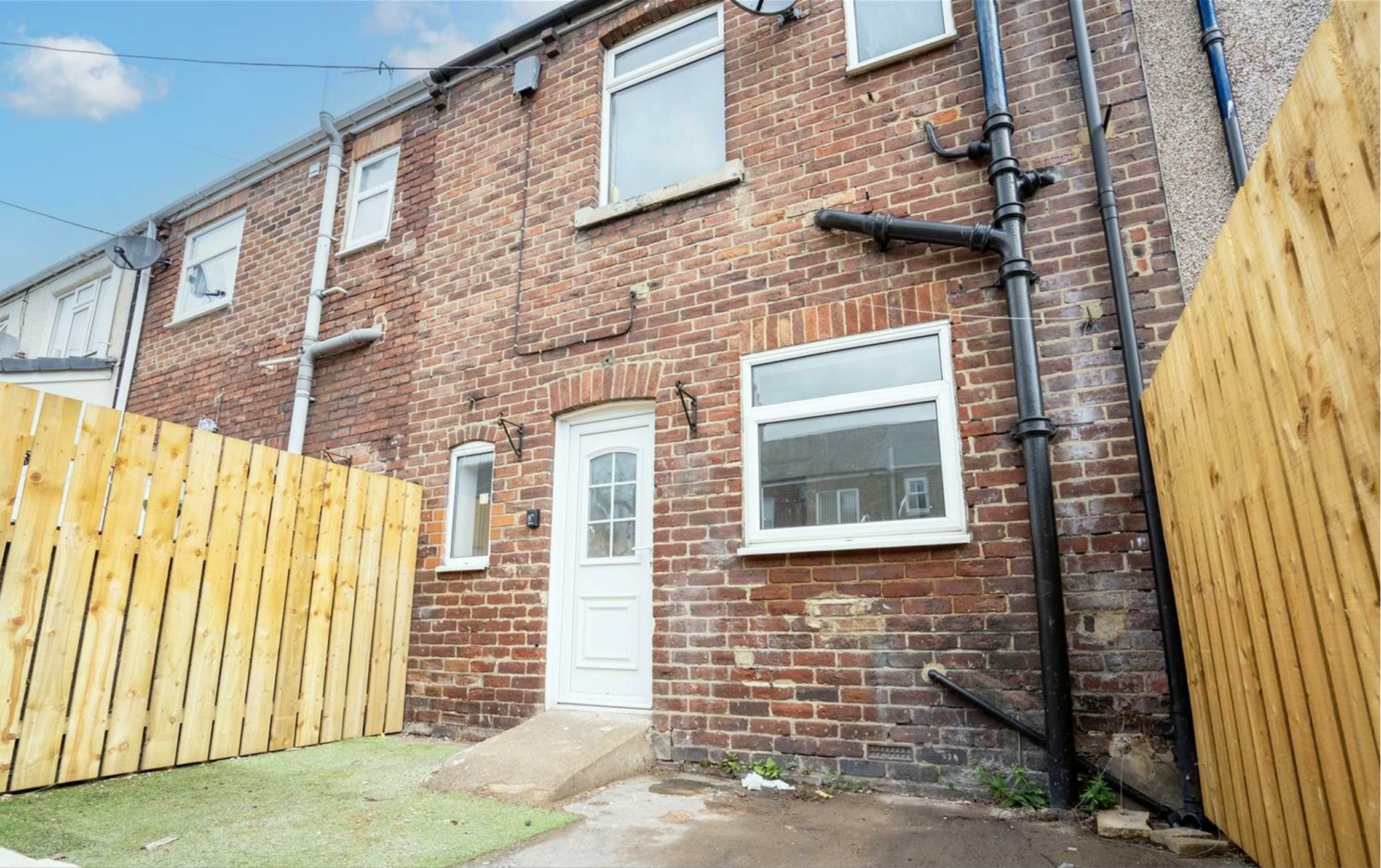
📍 Elm Street, Durham DH7 9SU